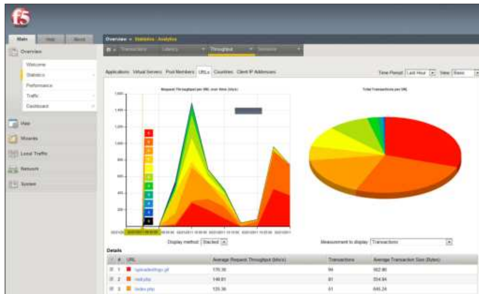
Figure 1: F5 Analytics provides real-time, application-level statistics.