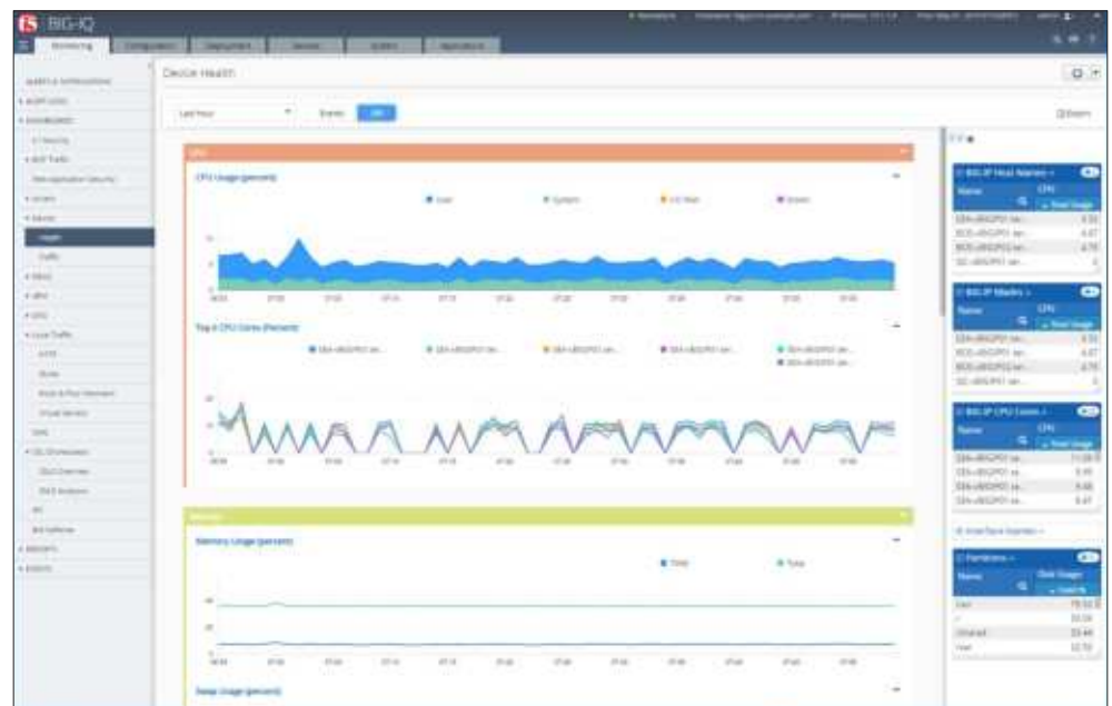
Figure 3: Manage your BIG-IP appliance health and track CPU and memory usage of physical and virtual platforms, hardware blades, and cores with BIG-IQ. Use logging and reporting to understand overall trends and spot areas needing correction. Easily manage policies, certificates, and licensing management to push out to all BIG-IP ADCs for centralized control of app services infrastructure.